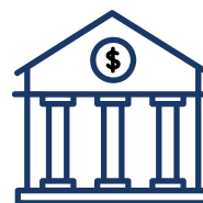
Reverse REPO operations