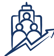
Private Equity shares